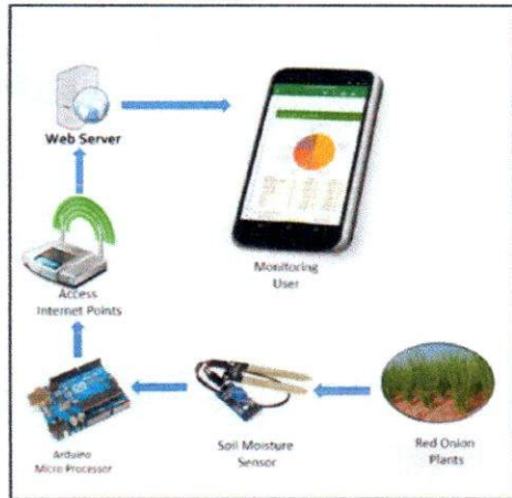
Fig. 1. Flow data acquisition

processed into time series data stored on the local database on the microprocessor by using internet network historical soil moisture data sent to the web server and stored in the database is then predicted which can be seen in Fig 1.